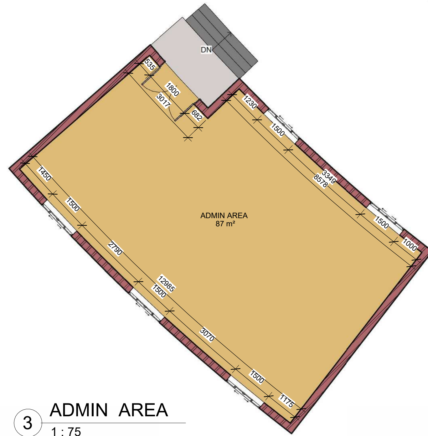
3 ADMIN AREA 1 : 75