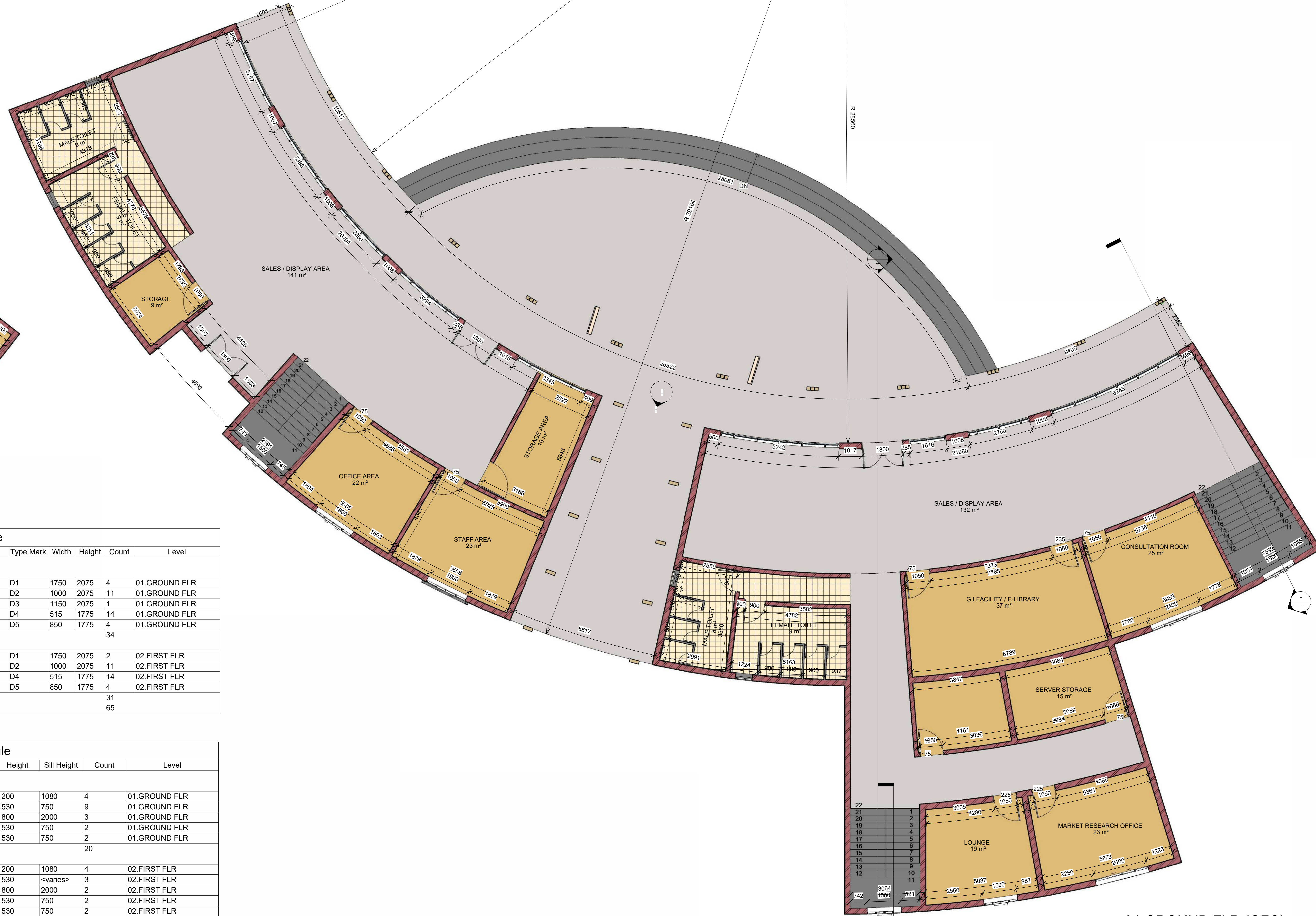
1 01.GROUND FLR (GFC) 1 : 75